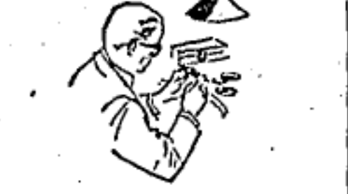
Highest Standard of Craftsmanship

Experienced craftsmen, working in their work-transferring our own designer's sketches into rings of exceptional workmanship.