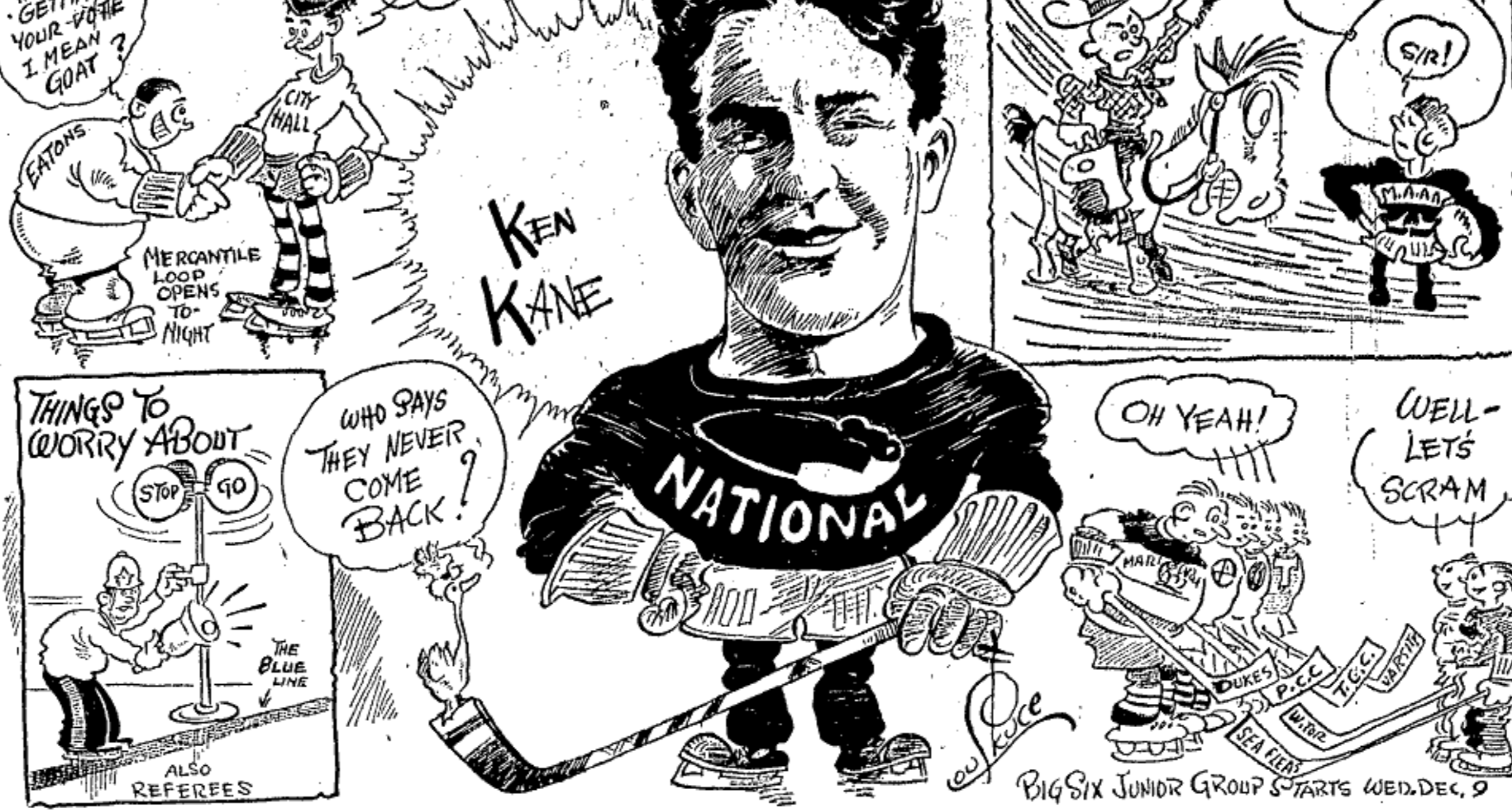
By LOU MARSH Sports Editor of The Star