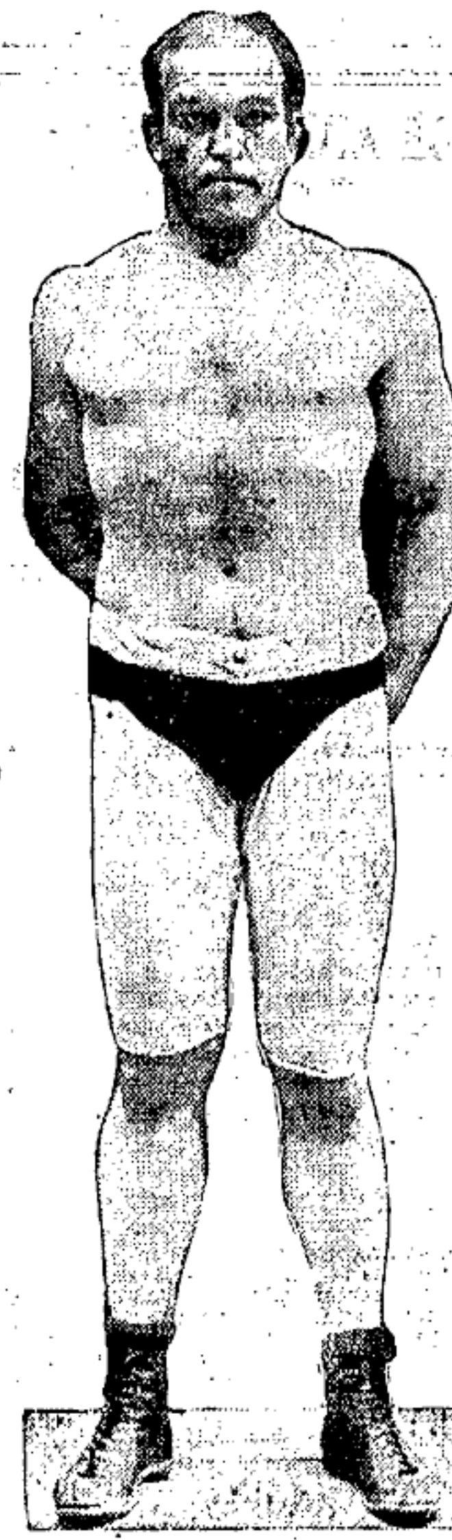
JIM JEFFRIES—His latest photograph, taken at Reno. Most of the critics call Jeff to win to-day's battle inside of 15 rounds.

BRANTFORD. Brantford, July 4.—Saturday afternoon, the C.L.A. game was played between Brantford and Toronto.