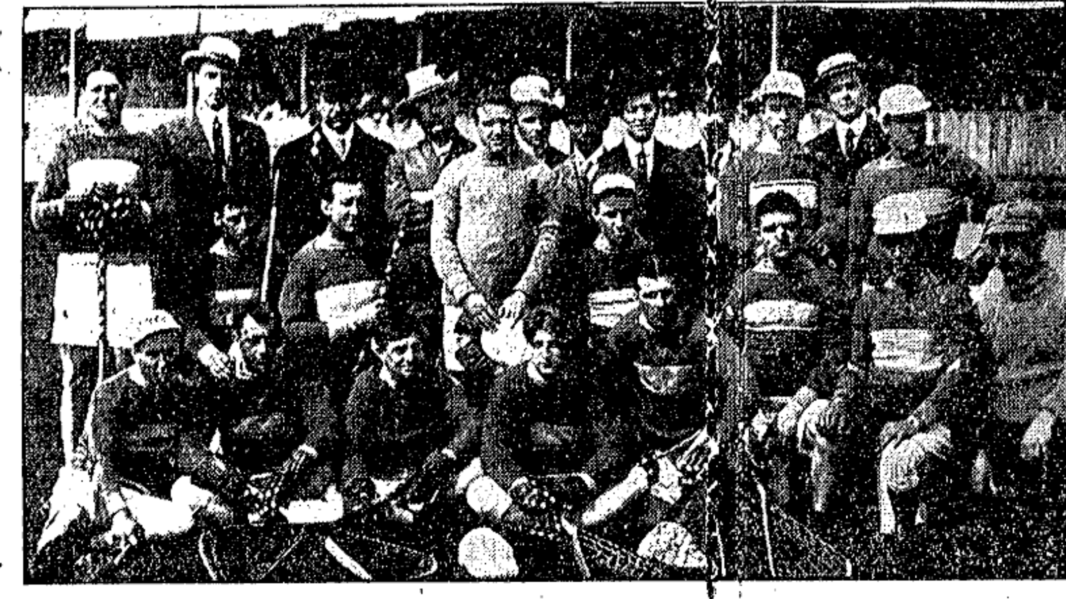
The National N.L.U. Team, Which Was Defeated by the Tecumseh's at the Island on Saturday.