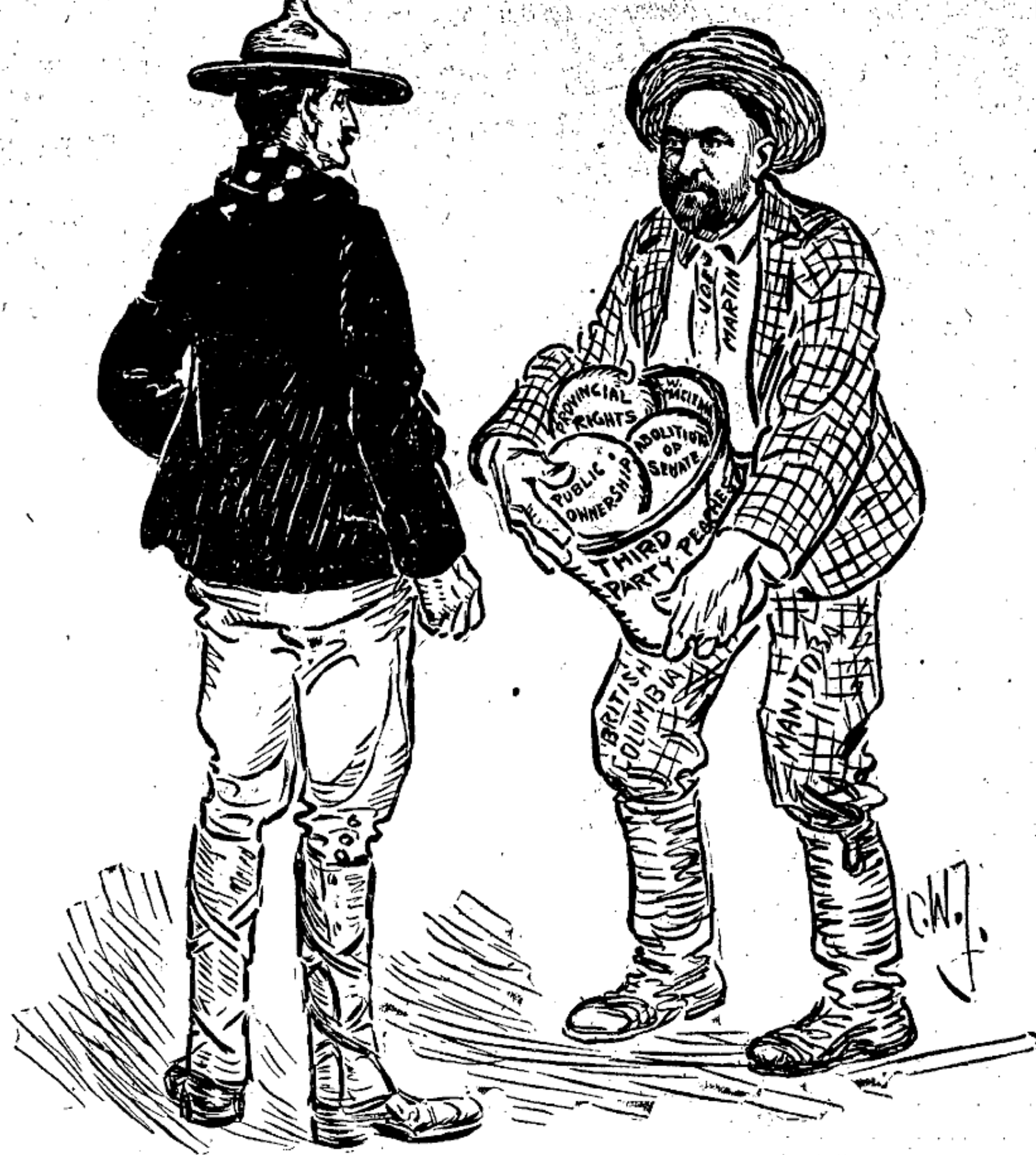
JOHNNY CANUCK—"Yes, Joe, but what are they like at the bottom?"